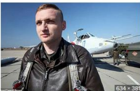
Pilot blamed by Moscow for shooting down fl...

In his oblast, there was a military airfield of the Ukrainian Air Force with armed and heavily armored Su-25 ground combat aircraft ready for action. The following fighter pilots of the Ukrainian Air Force were mentioned as ready for deployment: