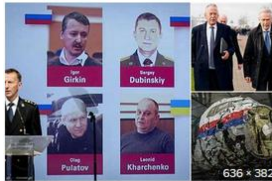
UK Home | Dally Mall Online dailymail.co.uk

The weapons used, including the BUK missile with this serial number, were all in the possession of the Ukrainian Air Force. But who were their superiors? In the picture the speaker with the four accused persons.