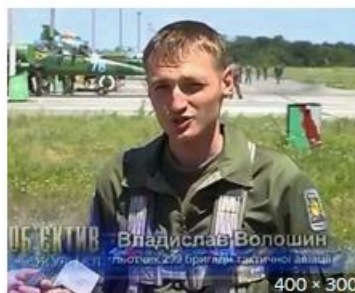
Studle nehody MH17 17.7.2014 - MH... mh17web.wordpress.com