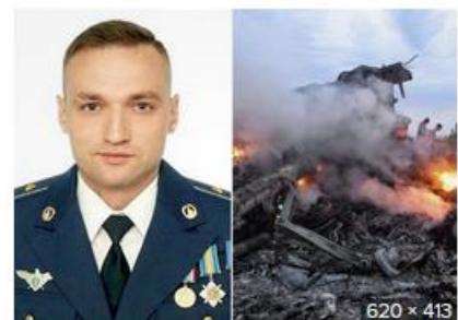
Pilot who Putin blamed for SHOOTING d... geralforum.com