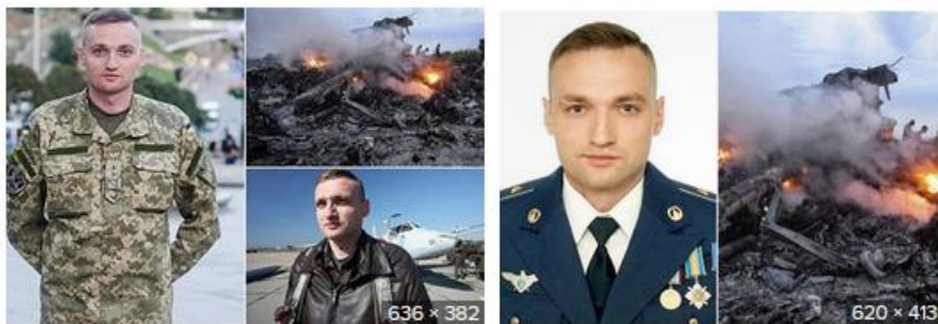
Pilot blamed by Moscow for shooting down... dailymail.co.uk

According to the testimony of witnesses, a maximum of three armed Su-25 ground attack aircraft were called. The flight order remained secret. Because the cockpits (pilot's cabin) of these ground combat aircraft were heavily armored to protect the pilot and were therefore also developed for ground-based combat missions, these aircraft were not intended for high altitudes. For this purpose, they needed to climb to an altitude of 10,000 meters, and as expected,